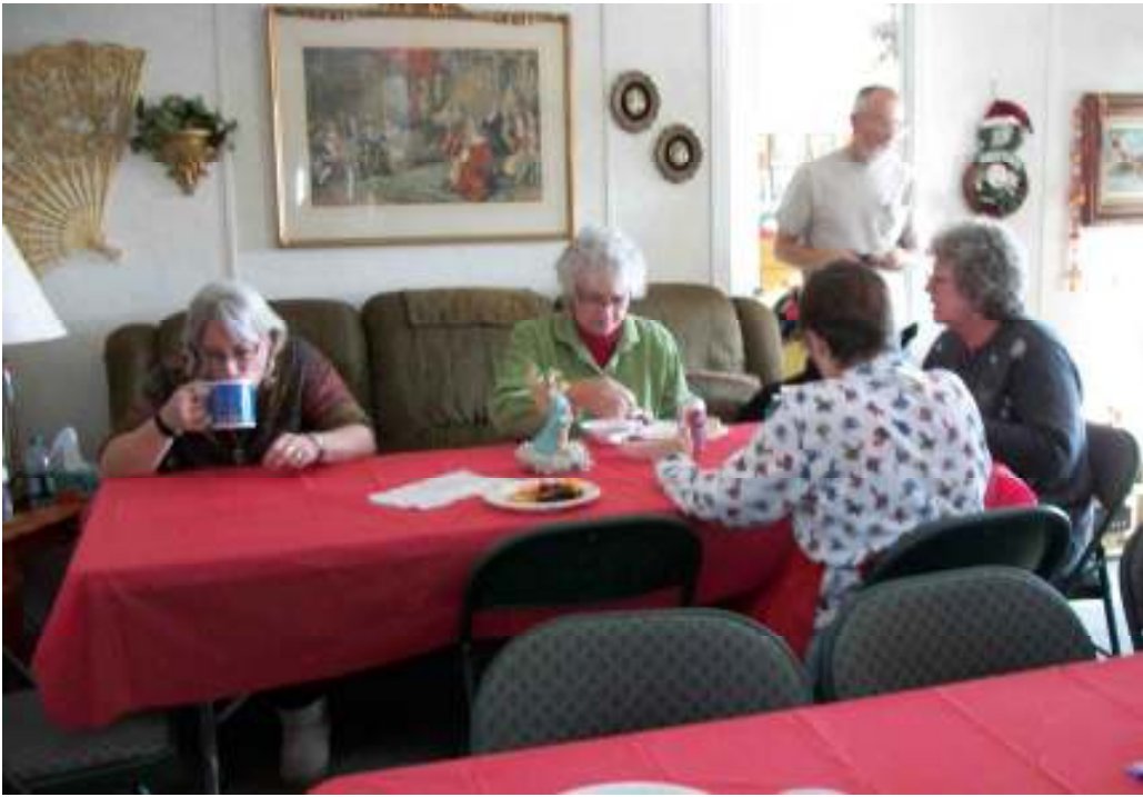
Christmas Party Dec 10