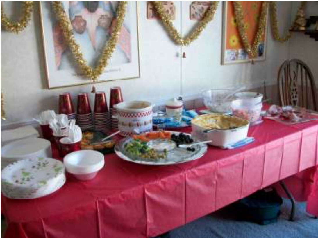
The yummy food at the Christmas Party !!