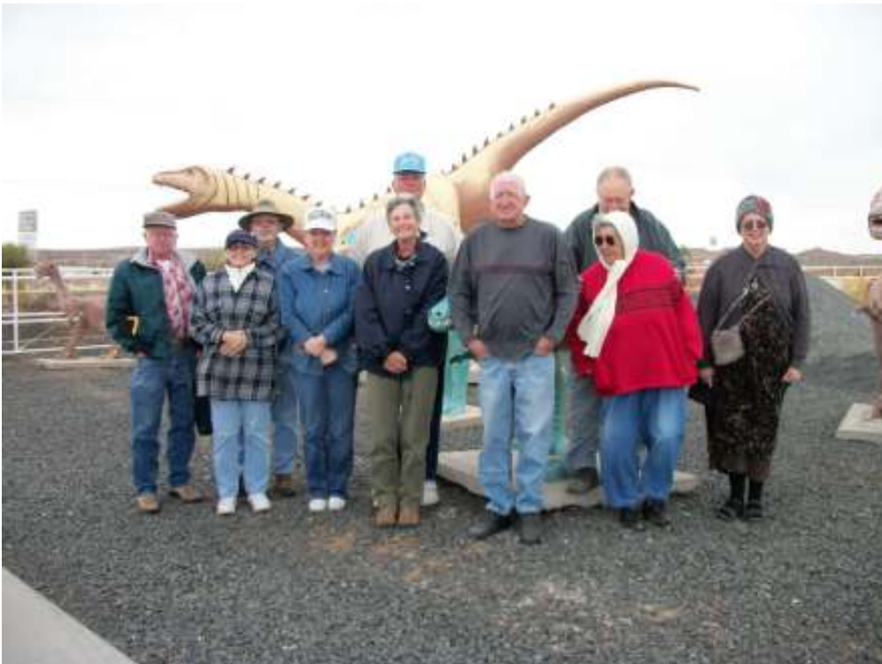
April 23 Group Field Trip