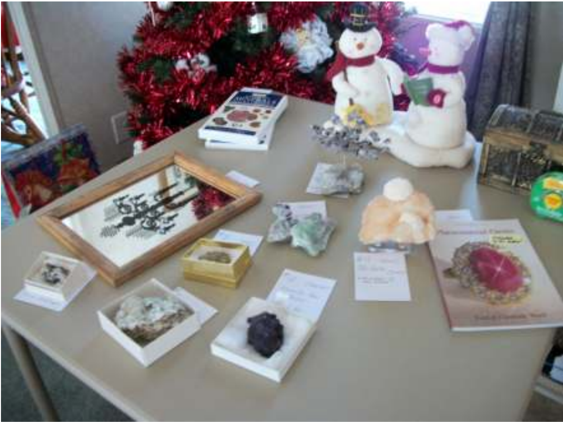
Christmas Bonus prizes Dec 10