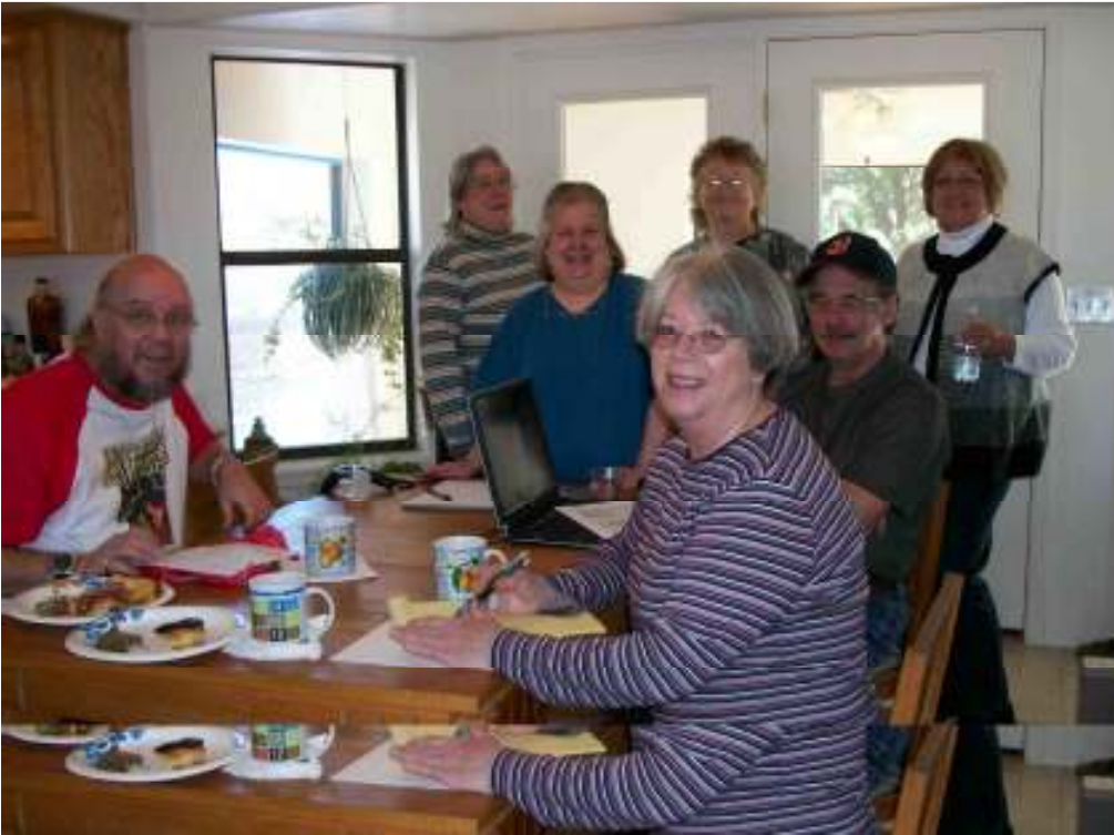
Board meeting January 22