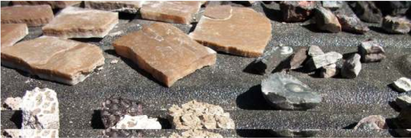
Fossil teeth St. Johns landfill Oct 22