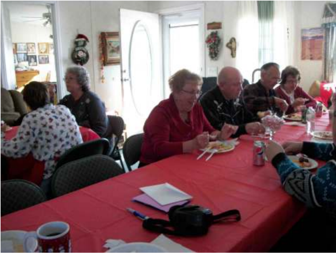
Christmas Party Chow Down !!