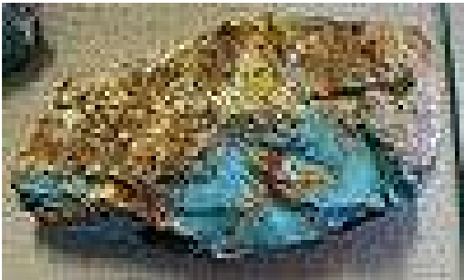
Turquoise in Crystal