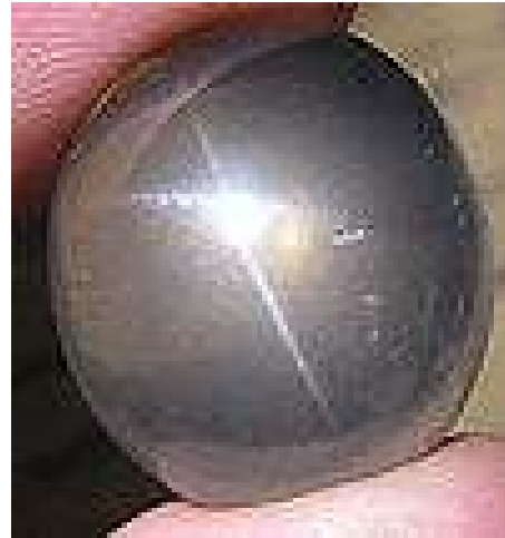
Star Blue Quartz

Lynne Wheeler 928-442-9529 lynnewheeler@gmail.com