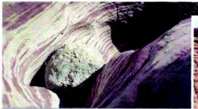
Rock in a hole.

I grew up in Maine, which is strewn with the broken remnants of old mountains, ground down to rocks and discharged on the land by glaciers. Digging in Maine's soil is a test of the will. And all those stone walls of Maine? Simply a place to deposit this year's latest crop of rocks forced to the surface by the processes of freezing and thawing.