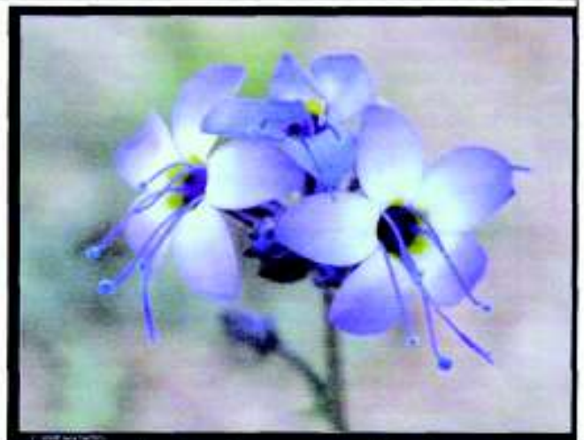
Gilia latiflora ssp. davayi is one of many common wildflowers that can be part of a multicolour carpet of wildflowers in the desert or lining the sides of the road. But a close-up look at these delicately-coloured blossoms shows they look anything but "common."

For more pictures and the rest of the story: http://www.desertusa.com/mag02/may/rocks.html